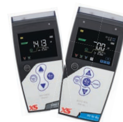
Conductivity meters and multiparameters