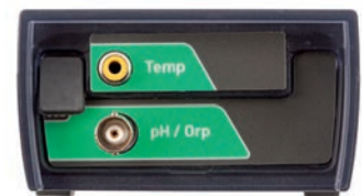
Connections on pH Vio