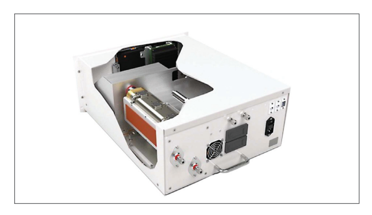
The back and inside of the MAX-iR FTIR gas analyzer.