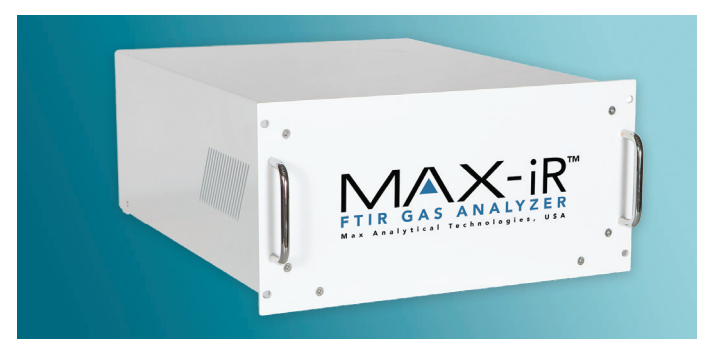
MAX-iR FTIR gas analzyer.

A deuterated triglycine sulfate (DTGS) detector comes standard with the MAX-iR analyzer. With the optional StarBoost technology, users can choose between indium arsenide (InAs) or mercury-cadmium-telluride (MCT) detectors. All systems come standard with Thermo Scientific™ MAX-Acquisition™ Automation Software and MAX-Analytics™ Software that provide industry-leading analytics, factory integration tools, high speed identification of compounds, and measurement accuracy/ stability without the need for calibration.