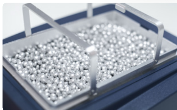
Tub with aluminum balls.