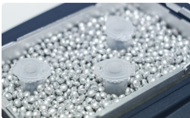
Example of adapted tubes inside the tank.

Water-resistant keyboard. Dual LCD with real-time display of temperature and time